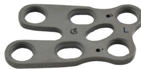
3.5 MM - 5.0 MM LCP MID FOOT C-PLATE