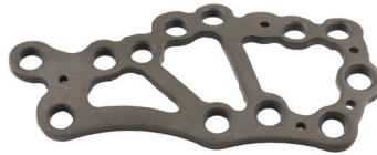
3.5 MM LCP CALCANEUS PLATE