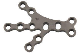
3.5 MM LCP FA-CALCANEOSUS PLATE