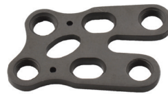
2.4-2.7 MM LCP MID FOOT C-PLATE

SIZE SIDE TYPE SMALL LARGE RIGHT LEFT TT