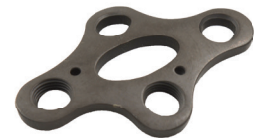
3.5 MM LCP TARSOMETA PLATE