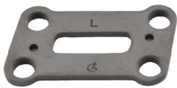
3.5 MM LCP RHOMBOID PLATE